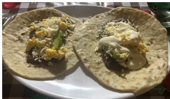
Lunch is Ready!