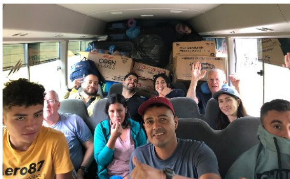
A full bus heading to San Jose