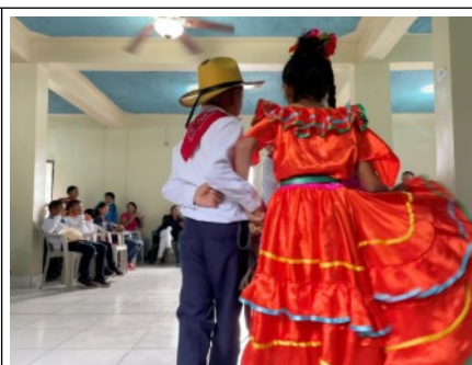
Dance partners in traditional Spanish dress