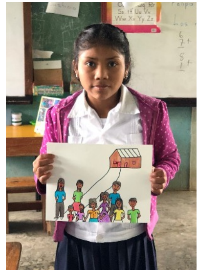
Student and her painting of her family

About 4 weeks before we left for Honduras, the UR Graduate Medical Education Office and the UR Legal Department decided we cannot treat patients in Honduras unless we have malpractice insurance in Honduras. Our current malpractice insurance only covers clinical work in the US. Therefore we have nothing to report about clinical care in San Jose. It was quite challenging to run into people while out hiking or having meetings and people were asking us for medical treatment for specific problems they had but we were unable to use our skills as physicians. Hopefully this issue will have a solution before our May trip.