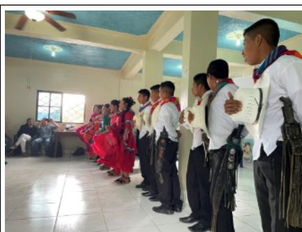
Boys and girls line up for a traditional dance