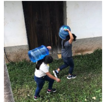
Scholarship students carry water for our group

Of the 33 students offered scholarships this academic year, one young woman will complete nursing school, and three girls will graduate high school with the hopes to continue their education into nursing school or the police academy. Eight students hope to be promoted to 12th grade in November as their grades were impressive this year. The remaining students continue to either do extremely well or struggle a great deal to obtain the 70% to pass to the next grade. The loss of educational classes during the pandemic seems to have most impacted those students in 7th and 8th grade. When school is closed during coffee picking season, students will be offered time to remediate before their final grades are submitted to the Department of Education. Four girls did not continue this year in the scholarship program.