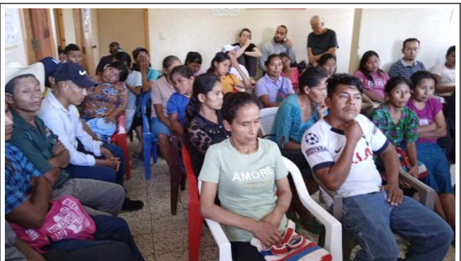
Community Meeting at start of trip