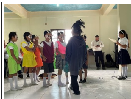
Educational play performed by the students